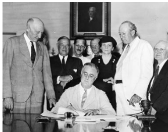
Franklin D. Roosevelt signs the Social Security Act in 1935. Secretary of Labor, Frances Perkins, who devised the system, is just behind him.

That’s because the American population is aging, with a rising ratio of retirees receiving Social Security benefits to workers paying into Social Security.