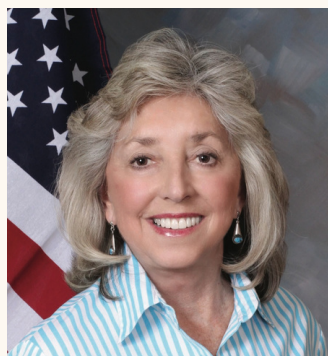
REP. DINA TITUS MISTRESS OF CEREMONIES