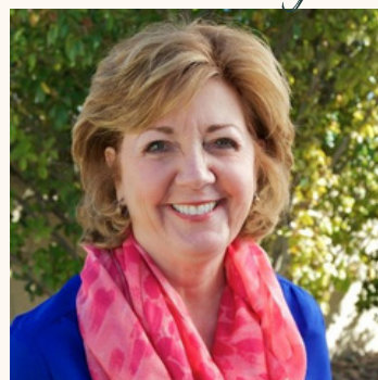
SENATOR MARILYN DONDERO-LOOP