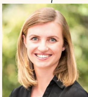
Senator Melanie Scheible